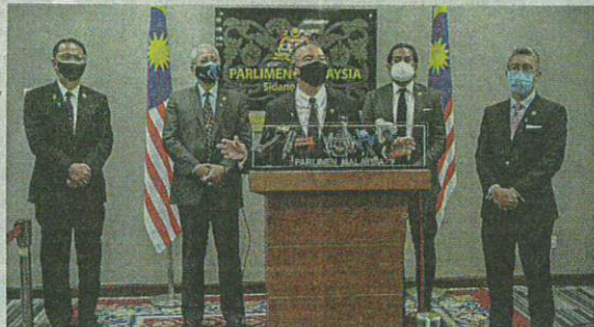
Press briefing: Hishammuddin speaking at Parliament yesterday. With him are (from left) Tan Sri Dr Noor Hisham Abdullah, Annuar, Khairy and Tengku Zafrul.

"The ministry will coordinate the announcements to ensure the information disseminated is consistent and easy for people to understand," Hishammuddin told a press confer-