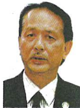
Noor Hisham Abdullah

Sementara itu, berdasarkan pangkalan maklumat COVID-NOW kendalian Kementerian Kesihatan (KKM), angka korban disebabkan COVID-19 di negara ini kelmarin, terus merekodkan pola penyusutan sejak 3 September lalu dengan terbaru 104 kes kematian dilaporkan dalam tempoh 24 jam.