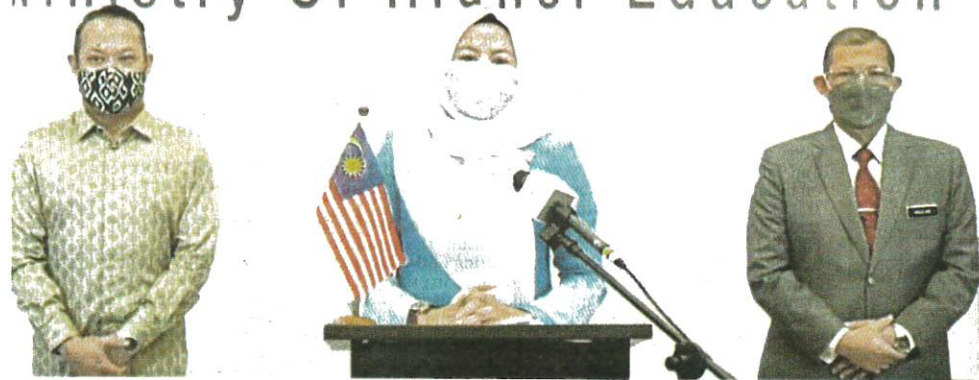
Higher Education Minister Datuk Seri Dr Noraini Ahmad making the announcement yesterday on the reopening of higher learning institutions.

Students who did not have access to an environment that was conducive to virtual learning would also be given priority to return to campus.