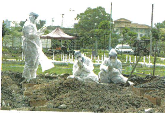
SEBANYAK 413 kematian Covid-19 dilaporkan kelmarin. – GAMBAR HIASAN

Berdasarkan maklumat yang dinyatakan, sebanyak 104 kes kematian sebenar dicatatkan kelmarin, meningkat sedikit berbanding kes kematian sebenar