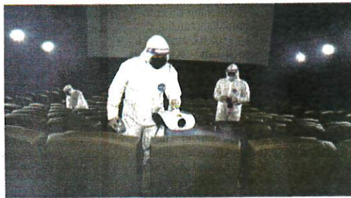
Kakitangan pawagam melakukan kerja-kerja sanitasi di dalam panggung selepas kerajaan membenarkan aktiviti panggung wayang kepada individu yang lengkap dua dos vaksinasi di Tanjung Golden Village (TGV) Cinema Sunway Velocity, Kuala Lumpur pada Selasa.

Kesihatan, Tan Sri Dr Noor Hisham Abdullah berkata, pertambahan itu menjadikan jumlah keseluruhan kes positif Covid-19 adalah 2,011,440 kes.